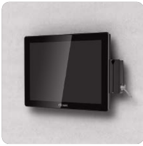
MOUNT ON WALL