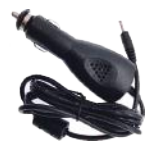
5V3A Car Charge